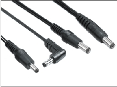
KD-401 \varnothing 4.0 \times 1.7 \text{mm} MONO PLUG KD-402 \varnothing 4.0 \times 1.7 \text{mm} L MONO PLUG (TUNING FORK TYPE) KD-551 \varnothing 5.5 \times 2.1 (2.5) \text{mm} MONO PLUG KD-401 \varnothing 5.5 \times 2.1 (2.5) \text{mm} MONO PLUG