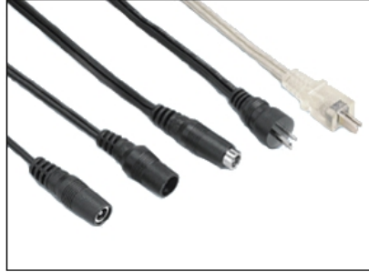
KD-55JA \varnothing 5.5 \times 2.1 (2.5) \text{mm} MONO JACK KD-55JB \varnothing 5.5 \times 2.1 (2.5) \text{mm} MONO JACK KD-55JC \varnothing 5.5 \times 2.1 (2.5) \text{mm} MONO JACK KD-605 LOUDSPEAKER PLUG KD-605B LOUDSPEAKER PLUG