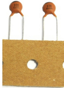
Stright Lead type