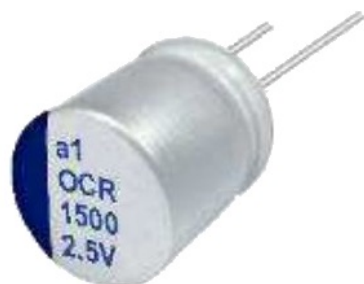
Diagram of Dimensions